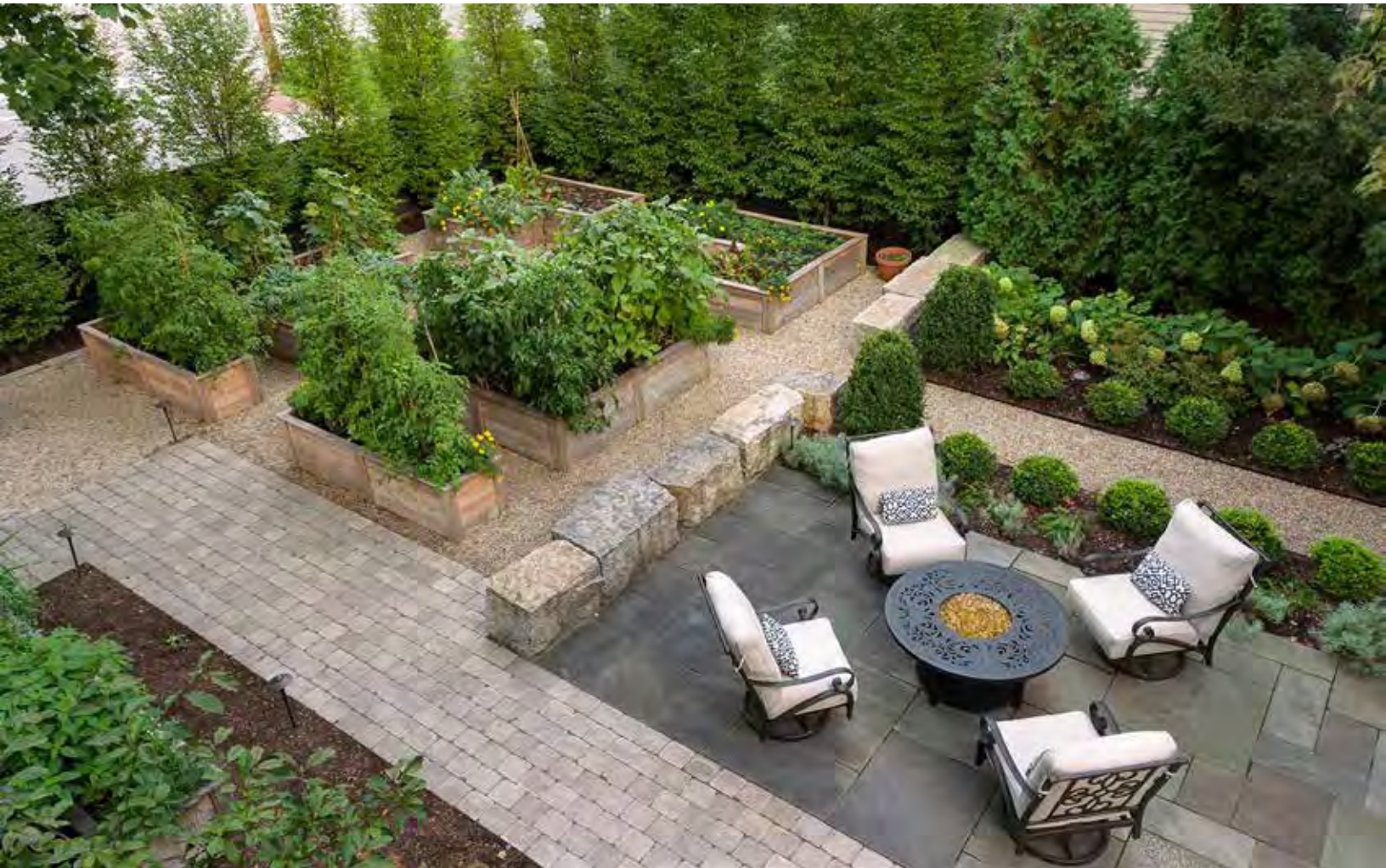
An aerial view of the fire pit and extensive and well-maintained raised bed vegetable garden. The granite block wall functions both as seating and to separate the two areas (above).