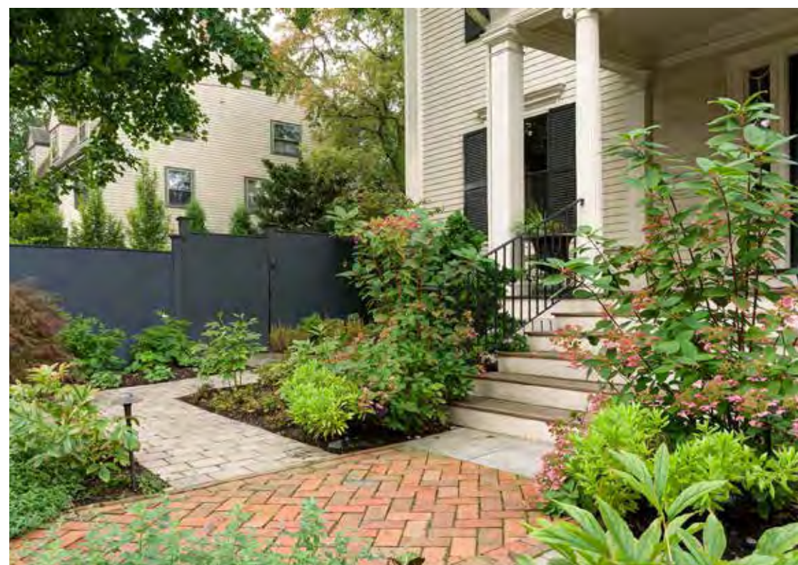
The “After” shot of the front yard matches the grandeur of the home. Notice how the custom-designed iron fence mirrors details of the home’s front door sidelights (top).