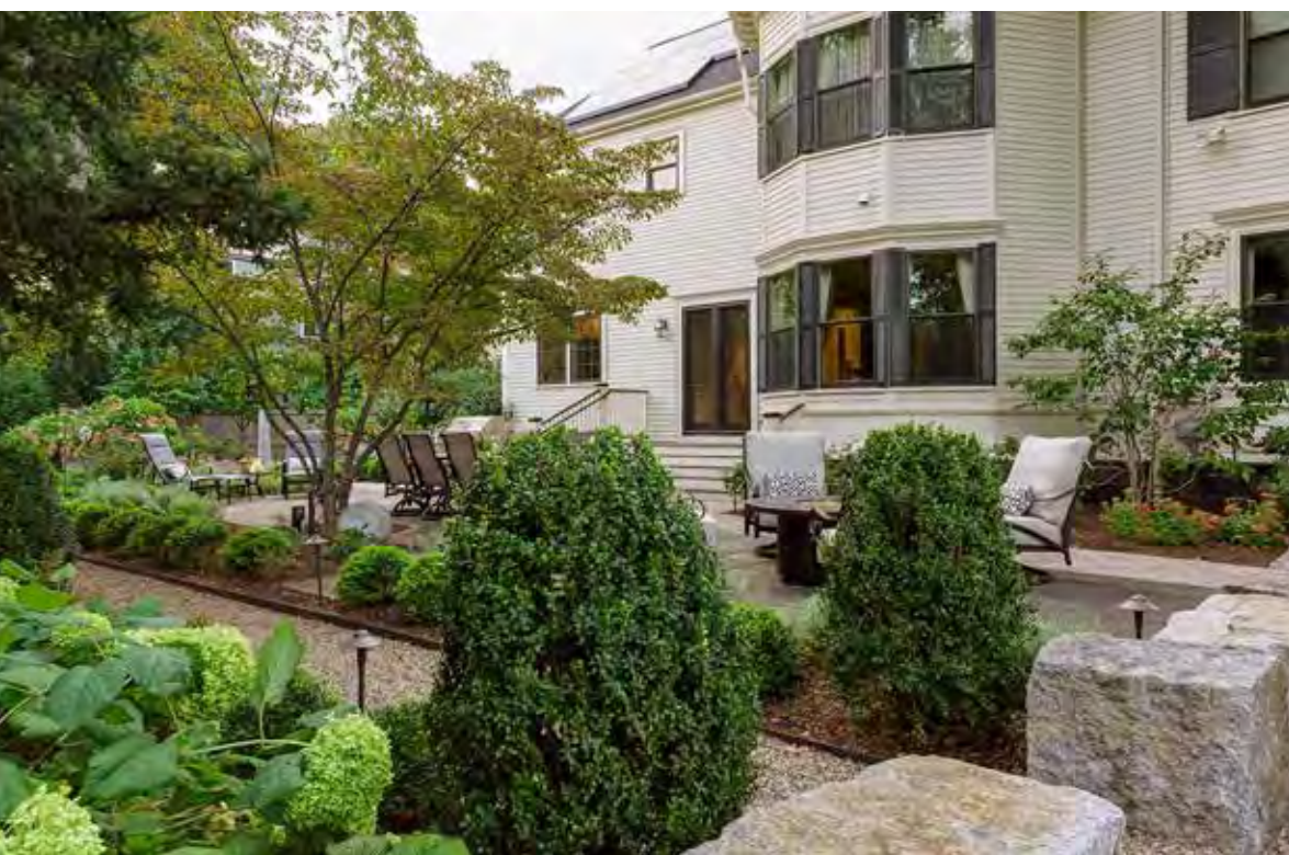
A back yard view to the house shows details of the plantings, including formal Boxwood and perennial plantings (left).